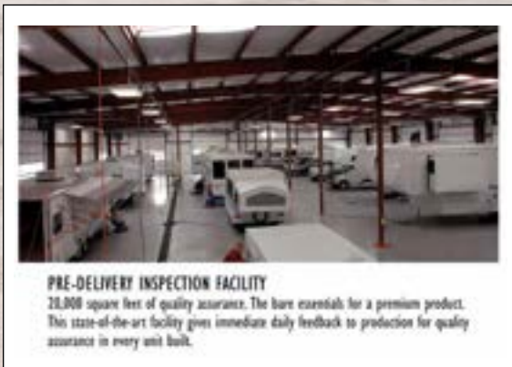
PRE-DELIVERY INSPECTION FACILITY 20,000 square feet of quality assurance. The bare essentials for a premium product. This state-of-the-art facility gives immediate daily feedback to production for quality assurance in every unit built.